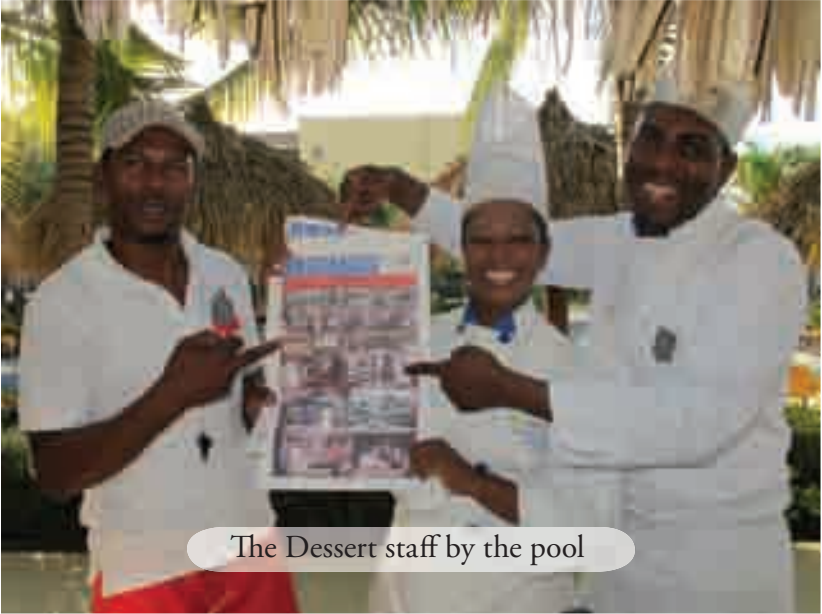
The Dessert staff by the pool