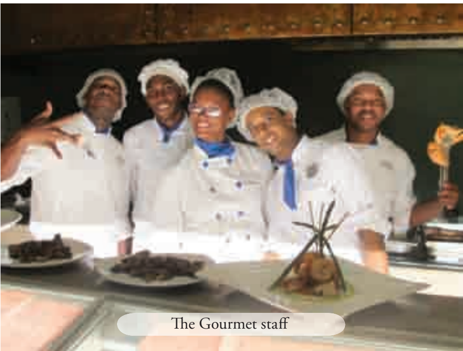
The Gourmet staff