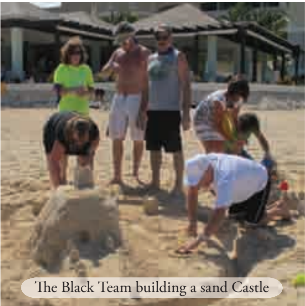
The Black Team building a sand Castle