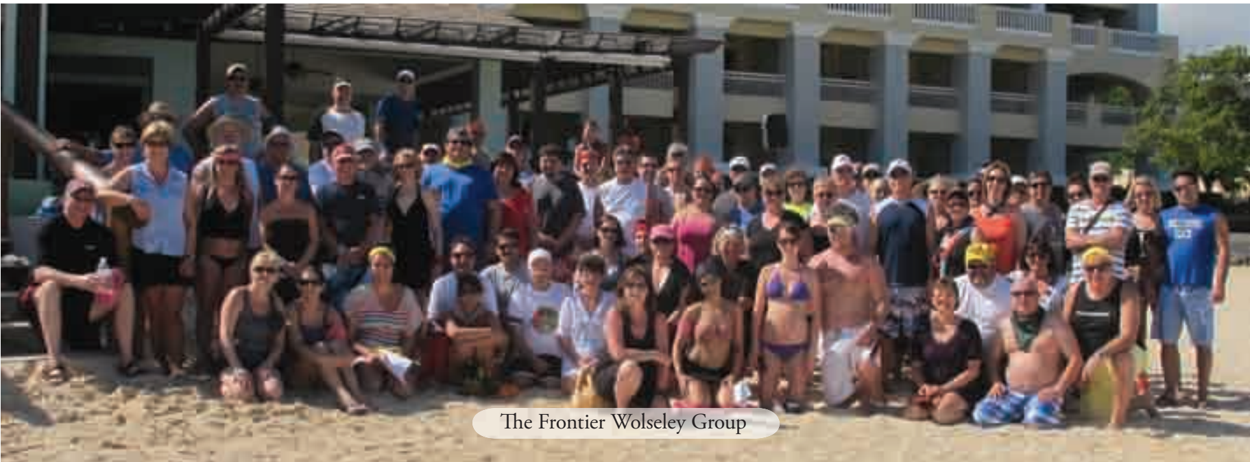
The Frontier Wolseley Group