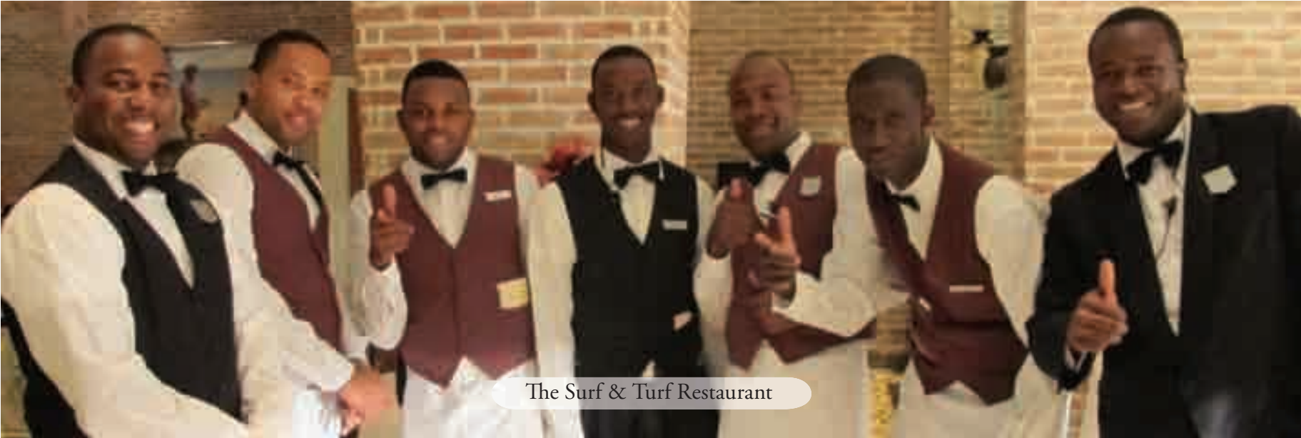
The Surf & Turf Restaurant